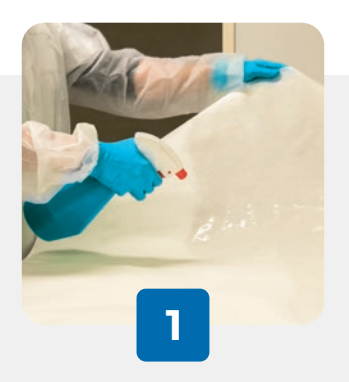
Using a sprayer, wet absorbing side of a piece of STK Lab with demineralized water